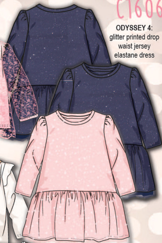
ODYSSEY 4: glitter printed drop waist jersey elastane dress