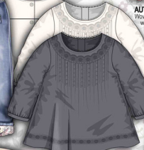
AUTUMN 8: Woven blouse with pintucks and crochet.