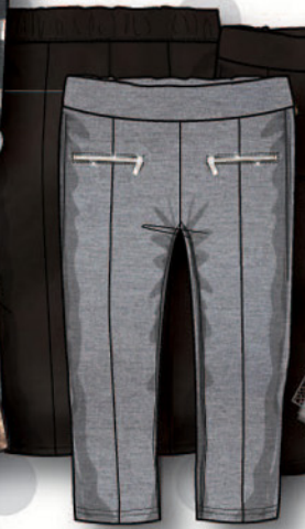
SHADES 11 Structured legging with shiny metal zips