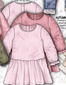
AUTUMN 11: Cheese cloth LS dress with elasticated rill cuffs.