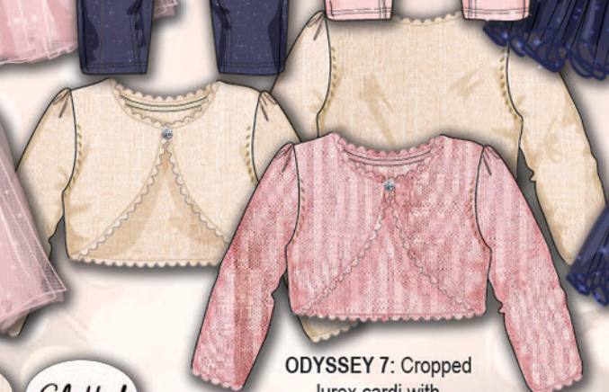
ODYSSEY 7: Cropped lurex cardi with scalloped knit edge