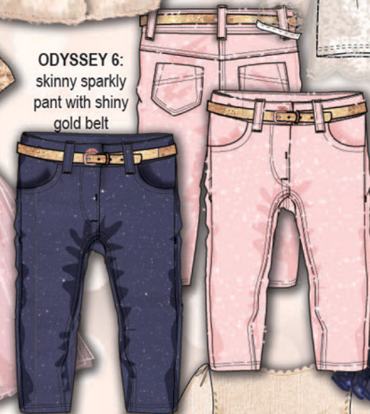
ODYSSEY 6: skinny sparkly pant with shiny gold belt