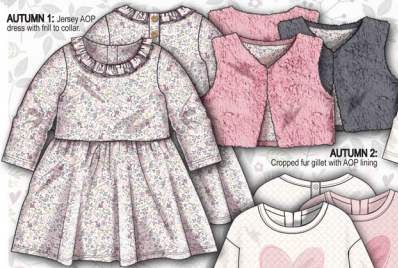
AUTUMN 1: Jersey AOP dress with rill to collar.