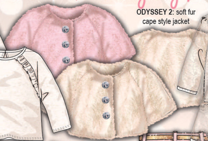
ODYSSEY 2: soft fur cape style jacket