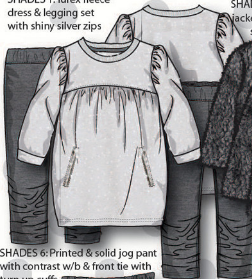
SHADES 1: lurex fleece dress & leggings set with shiny silver zips