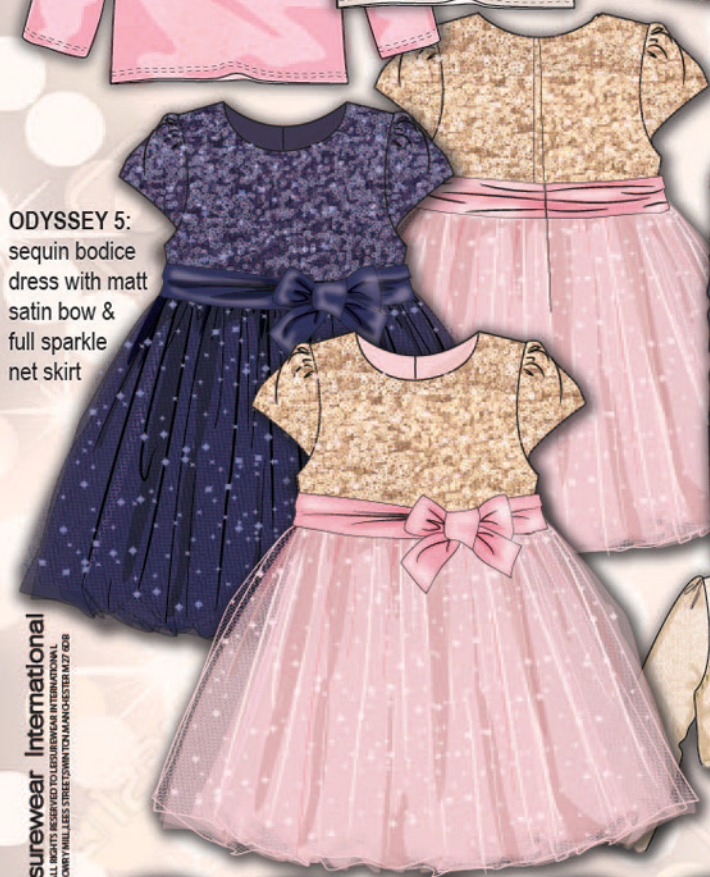
ODYSSEY 5: sequin bodice dress with matt satin bow & full sparkle net skirt