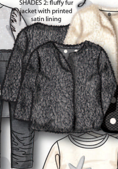
SHADES 2: fluffy fur jacket with printed satin lining