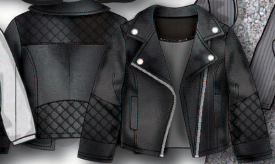
SHADES 8: PU biker with quilted panels & shiny silver trims