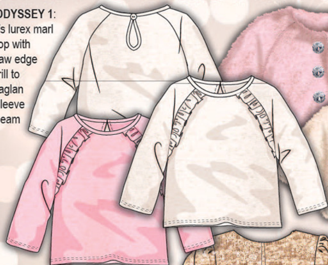
ODYSSEY 1: l/s lurex marl top with raw edge frill to raglan sleeve seam