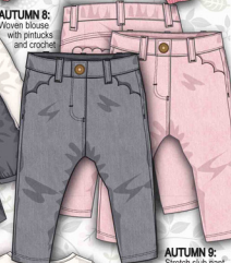
AUTUMN 9: Stretch slub pant.