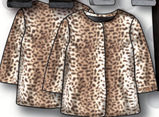
SHADES 10: Leopard fur jacket with satin lining