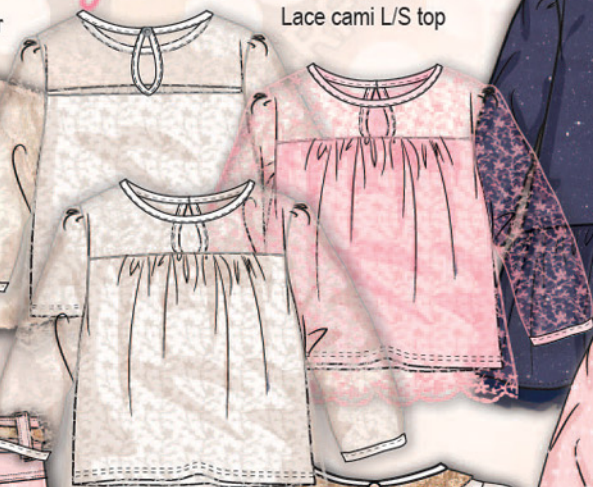
ODYSSEY 3: Lace cami L/S top