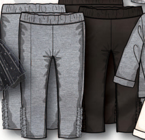
SHADES 13: 2 PACK legging set with self fabric frill to side leg at hem