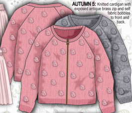
AUTUMN 5: Knitted cardigan with exposed antique brass zip and self fabric bobbles to front and back.