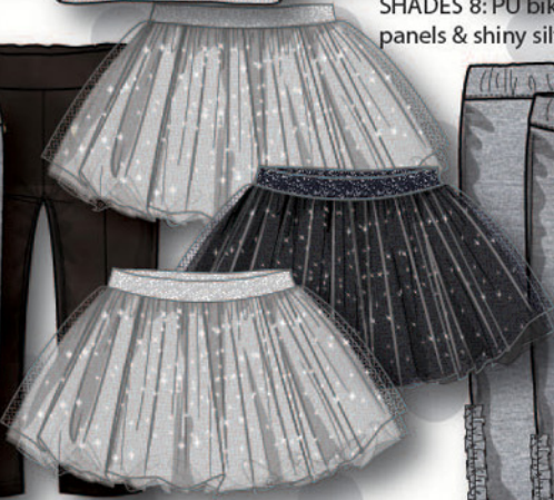
SHADES 12: Glitter tutu with lurex elastic waistband