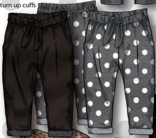
SHADES 6: Printed & solid jog pant with contrast w/b & front tie with turn up cuffs