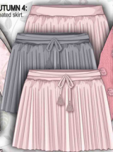
AUTUMN 4: Pleated skirt.