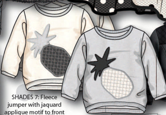
SHADES 7: Fleece jumper with jaquard applique motif to front